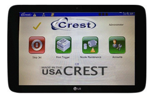
Touch Screen With Universal Icon Menu