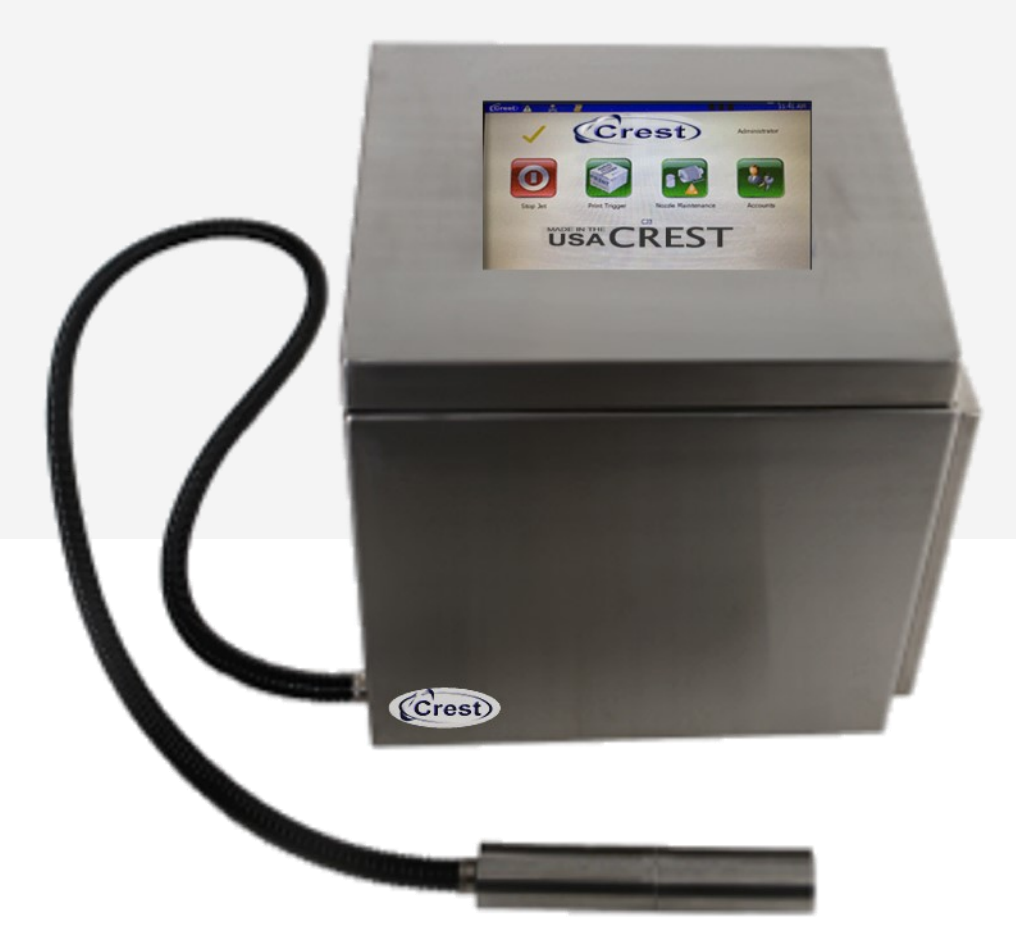
The Best Value CIJ Coder In The Industry