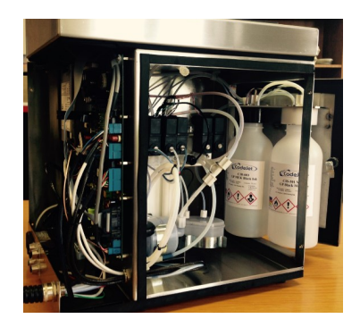
Industrial Quality Stainless Steel Easy Access Enclosure